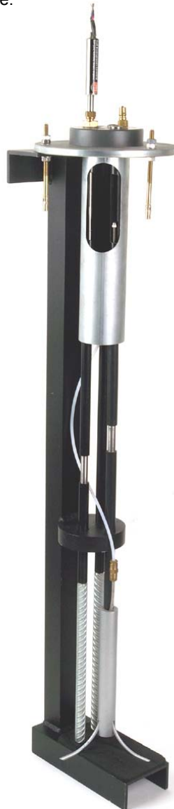
Rod extensometer complete with anchor points (displayed on stand)

Each rod individually isolated by a plastic sleeve. The complete assembly is grouted in place, fixing the anchors to the rock or soil but allowing free movement. A multipoint reference housing receives all rods from the one drillhole installation. Facilities are available for manual or remote read-out and data logging. Rod extensometer units can, when required, be surface mounted, for example to measure displacements across tension cracks or joints, and can be buried in fill or cast in concrete.